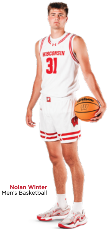
Nolan Winter Men's Basketball