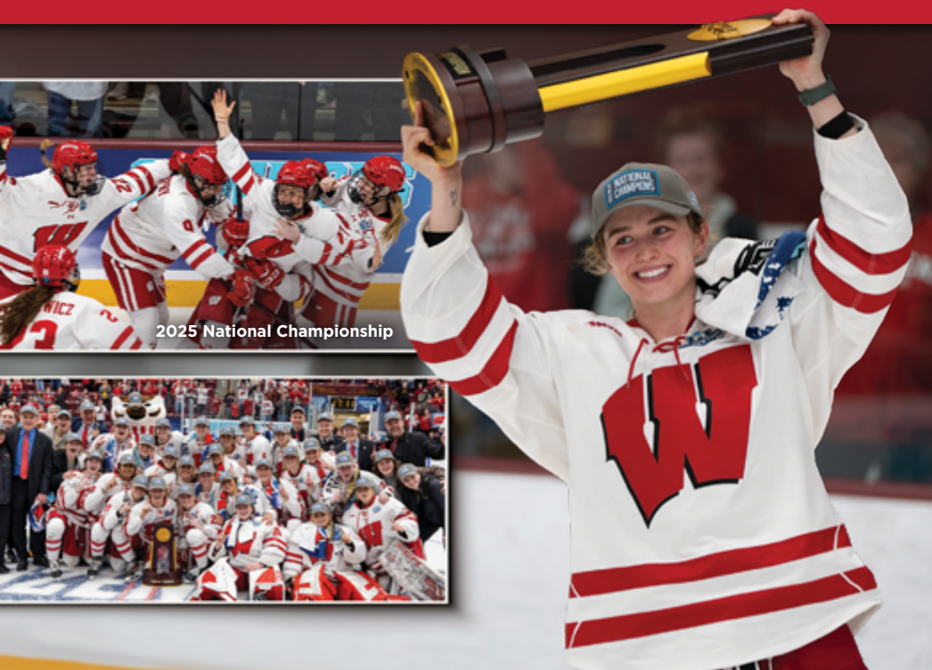
2025 National Championship